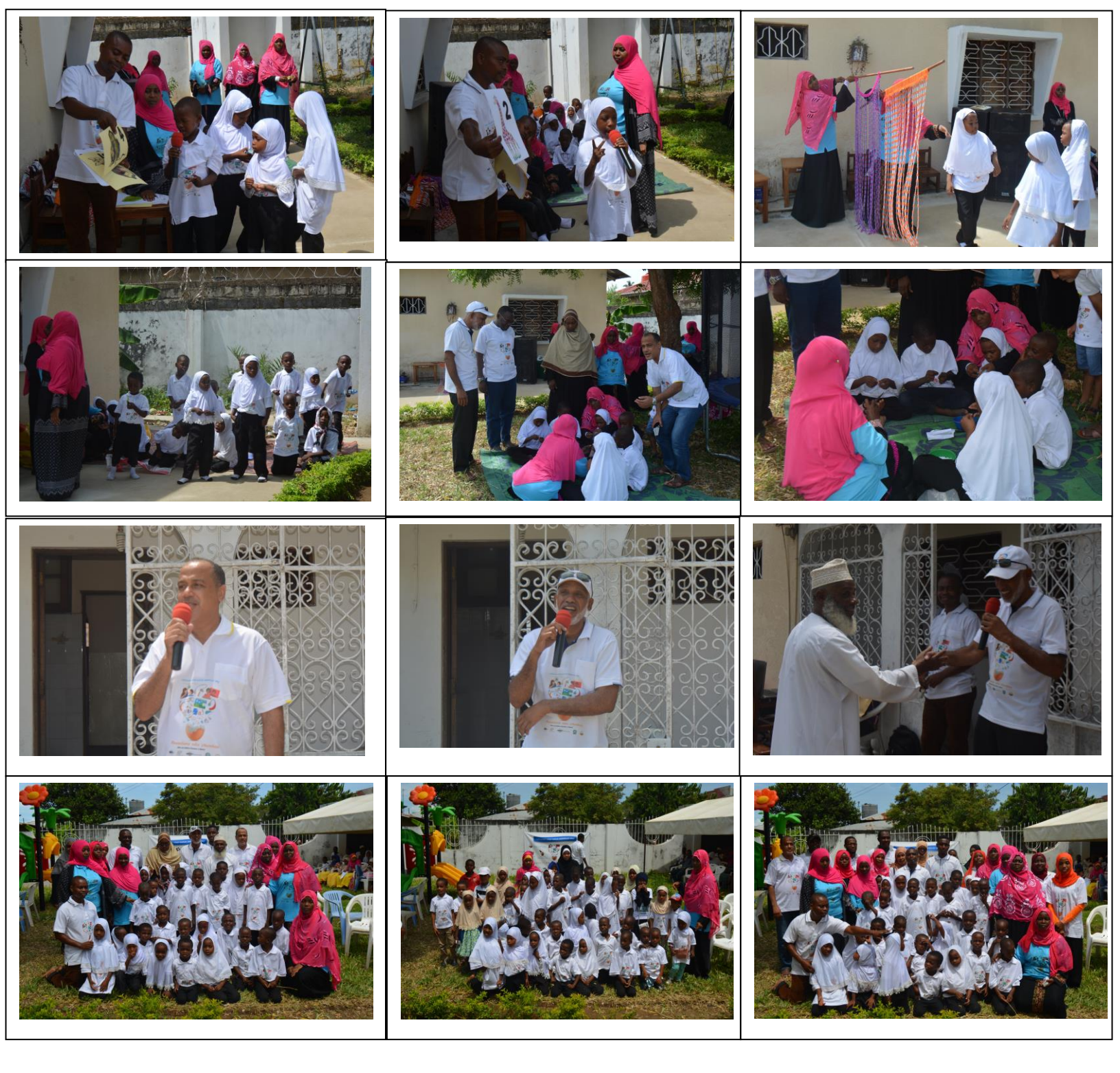
4. Health education, Screening and treatment of ear diseases at Mwanakwerekwe Primary school